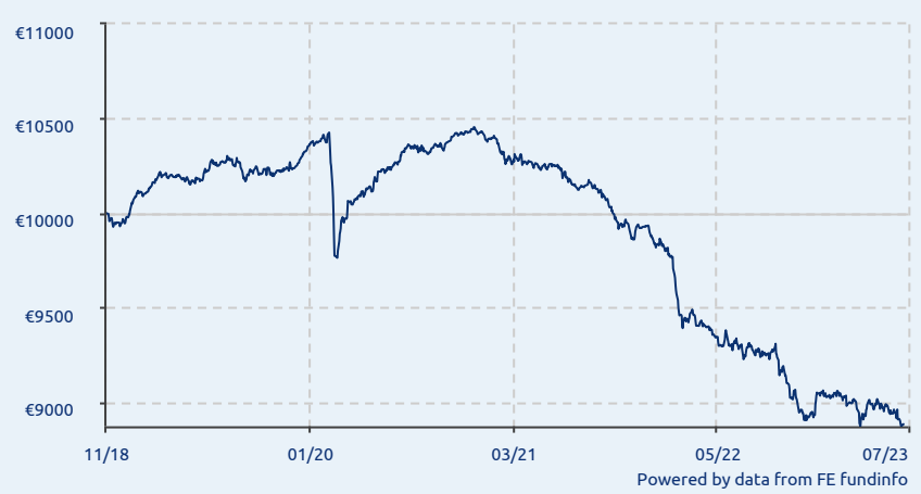
■ Standard Life Absolute Return Global Bond Strategies

Performance is net of 1.20% Annual Management Charge (AMC), gross of taxes. Your AMC may be different, please talk to your financial adviser or contact us for more information.